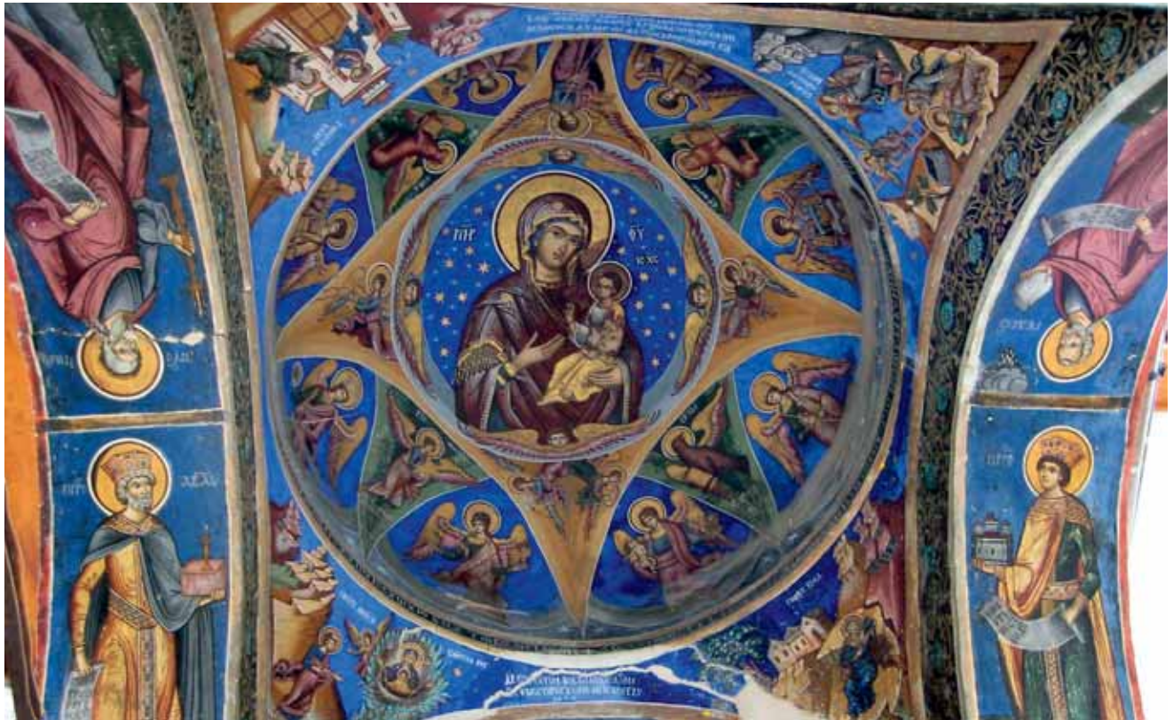
Icons are a prominent part of Eastern Orthodoxy, which is the national faith of Romania. While the Romania Semester students could not understand much of the worship services they attended, they were able to experience the gospel through the symbolic images that cover nearly every surface of most Orthodox churches.

Learn more about the New Horizons Foundation, Viata and IMPACT at www.new-horizons.ro .