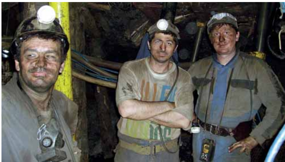
Although there are still some jobs for coal miners, the unemployment rate in Romania's Jiu Valley is 50 percent. Since being allowed to join the European Union, Romanians are free to work throughout Europe. The resulting exodus of workers is affecting family and civic life.

"The partnership with Northwestern brought community, energy and joy to our efforts again. These students helped us see our work with Romanian young people through new eyes. It is no exaggeration to say this partnership makes the furtherance of the mission and programs of New Horizons sustainable."